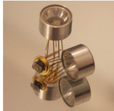
Main thermocooler parameters (without load)