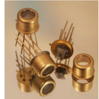
Main thermocooler parameters (without load)